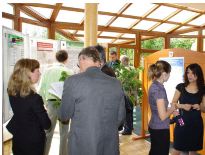
Poster presentation at the hall of the conference hotel

ISSE 2011 was an international event focused on exchange of information between senior and young scientists from academic communities and electronic industries. The leading title of the conference – "New Trends in Micro/Nanotechnology" – defined this year's hot topics, which included experimental and theoretical work in a very wide-spread field of electronics, micro and nano-electronics technology and packaging.