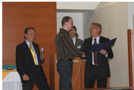
Awarding ceremony at the closing session of ISSE2011

Based on a unique combination of oral and poster presentations as well as individual meetings, this forum provided unique opportunities for professors, students, senior and junior researchers to discuss their scientific and educational topics and organize international cooperation in a convenient atmosphere during the conference days.