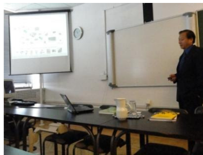
The presentation of Dr. Dongkai Shangguan

Product Miniaturization and Reliability. The presentation reviewed advanced packaging and assembly technologies for miniaturization; and outlined the scope of development for complete assembly capability, including PCB design; solder alloy; process optimization; equipment technology; reliability, etc. Several critical reliability issues in lead-free solder interconnects were also discussed. It was also pointed out that miniaturization, functional densification and integration, along with environmental compliance, fast time to market, low cost and high reliability continue to represent the leading trend for electronics products.